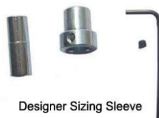
Designer Sizing Sleeve